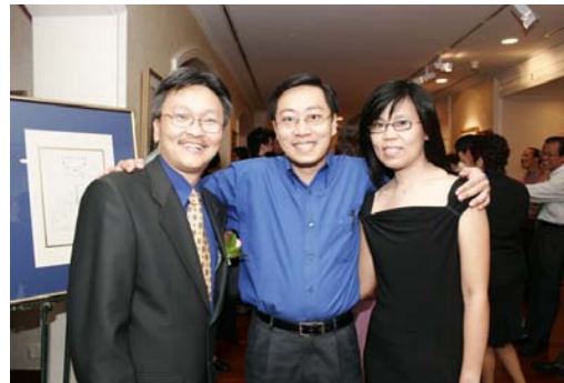
Our relationships with people will determine our success in life

This workshop will serve as an inspiration and practical guide for leaders and members to discover secrets to lasting relationships. Discover that God’s very nature is relational.